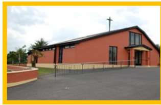
St. Patrick's Church,