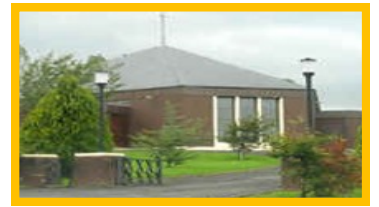
St. Mary's Church, Convoy