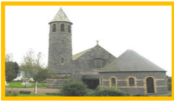
St. Eunan's Church,